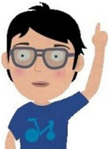
RAISE YOUR HAND