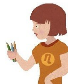
SHARE WITH OTHERS