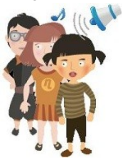
LINE UP QUICKLY