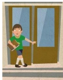
RESPECT THE SCHOOL