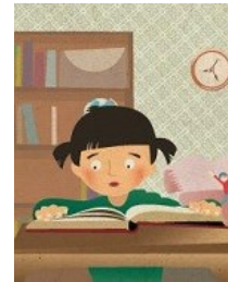
DO YOUR HOMEWORK