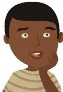
LISTEN TO YOUR TEACHER